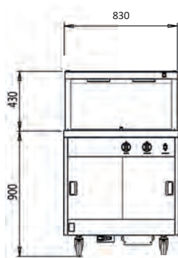
Measurements in mm