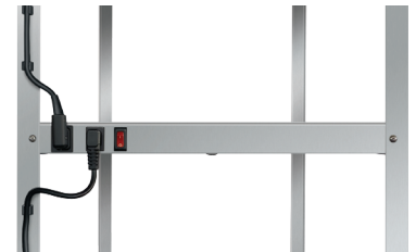
Power On/Off switch, and jumper power cords for each shelf

For operation, location and safety information, please refer to the Installation & Operating Manual.