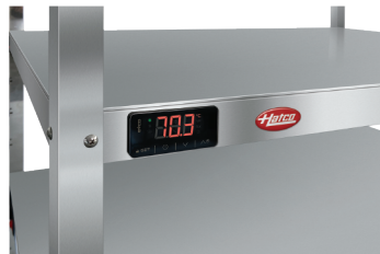
Digital temperature control for each shelf